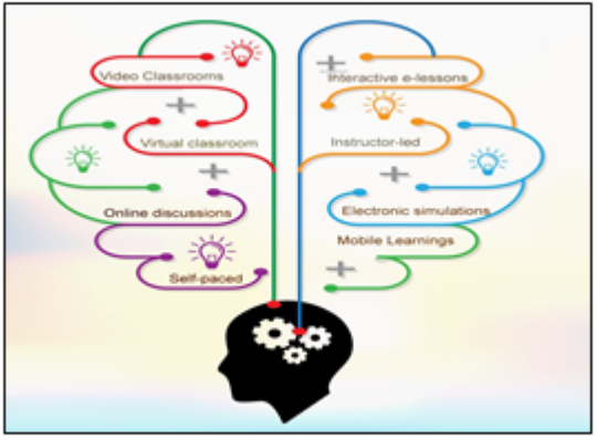
Figure:1 ICT-Supported Learning Methods

There are several advantages to online education, but certain problems could still arise when using it. Some people have reservations about learning online due to issues including the absence of personal connection with teachers, the difficulty of receiving detailed feedback, and the abundance of possible distractions. The techniques of learning with ICT are shown in Fig. 1.